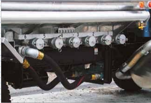
(2) Pumping Systems, Air Emergency Valves with 3" OPW Dry Break Adaptors