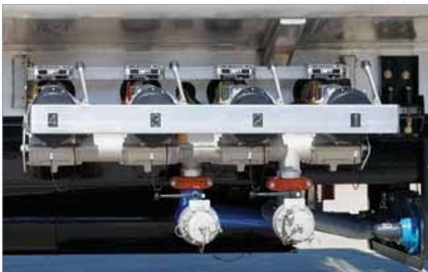
Civacon Air Operated Double Manifold with Openable Bottom Loading Adapters