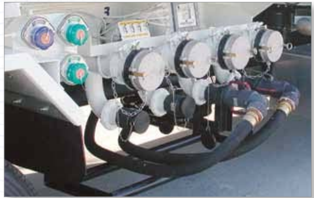
(2) Pumping Systems, Air Emergency Valves, EBW Non-Openable Bottom Loading Adaptors with 3" Emco Dry Break Adaptors