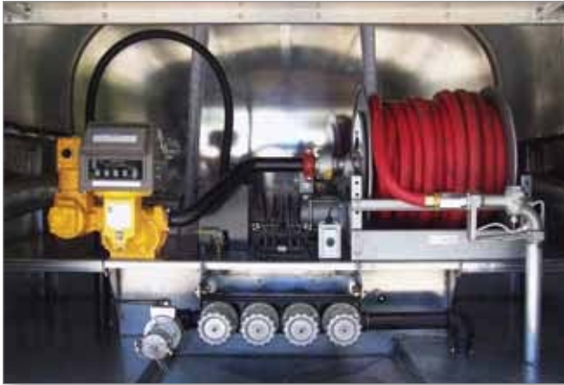
Betts Manual 4-Compartment Manifold at Rear with 2" Suction Point