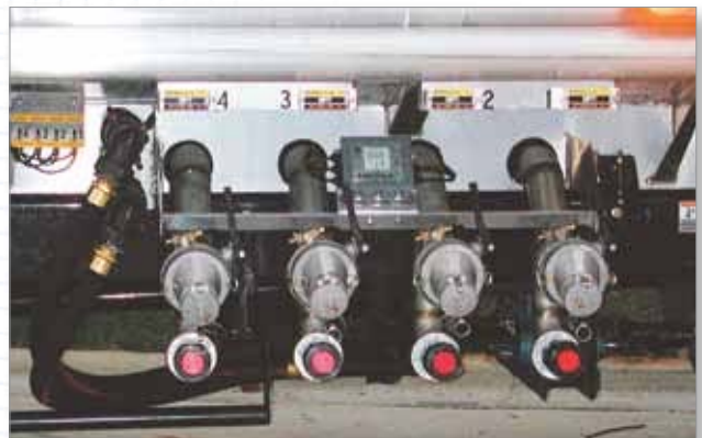
(2) Pumping Systems, Air Emergency Valves, EBW Openable Bottom Loading Adaptors with 3" Emco Dry Break Adaptors