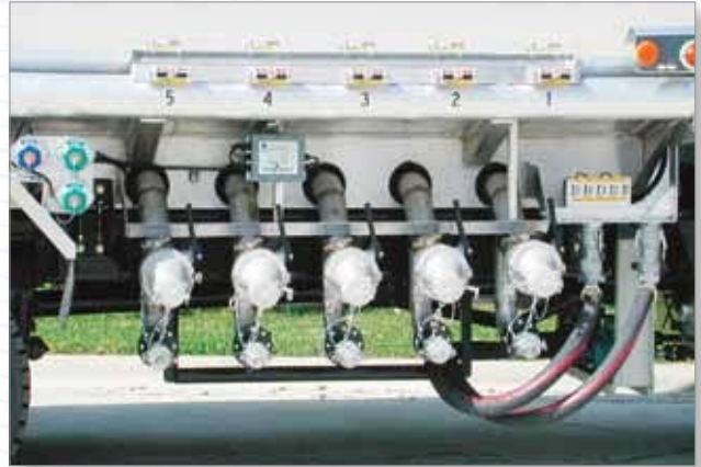
(2) Pumping Systems, Air Emergency Valves, EBW Openable Bottom Loading Adaptors with 2" OPW Dry Break Adaptors