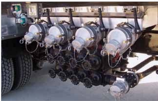
Betts 4-Compartment Double Manifold with Openable Bottom Loading Adapters