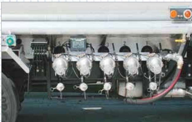
(2) Pumping Systems, Mechanical Emergency Valves, EBW Openable Bottom Loading Adaptors with 2" OPW Dry Breaks