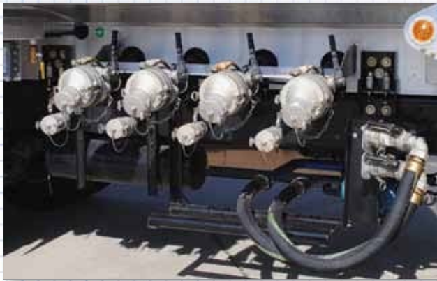
(2) Pumping Systems, Air Emergency Valves, EBW Openable Bottom Loading Adaptors with Offset 2" OPW Dry Breaks