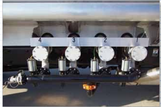
Custom Built 4-Compartment 3" Air Operated Manifold with 2" Suction Point