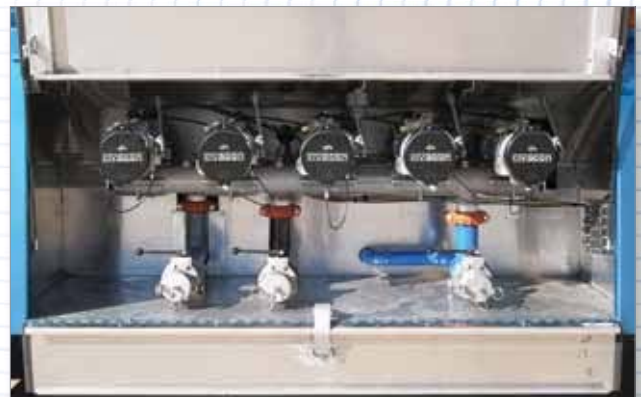
Civacon Air Operated Triple Manifold with Air Emergency Valves and 3" Suction Points