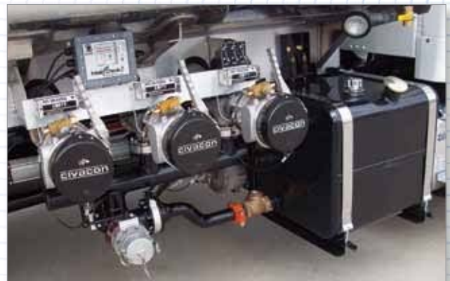
Custom Built 3-Compartment 3" Air Operated Manifold with Openable Bottom Loading Adapters