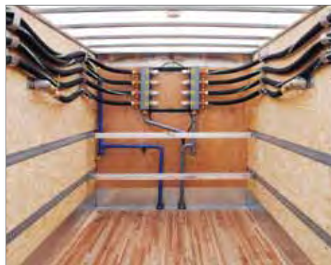
9 Tote System

Oilmen's supplies PTO or hydraulic pumping systems in a variety of configurations.