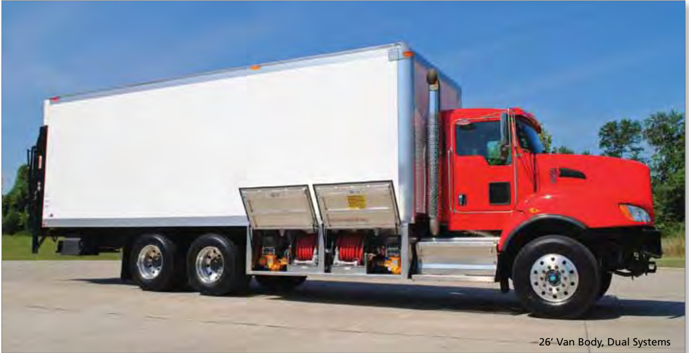
26' Van Body, Dual Systems