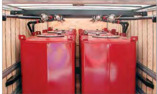
Dual Systems for 12 Totes

Any size Tote Option available with top or bottom suction.