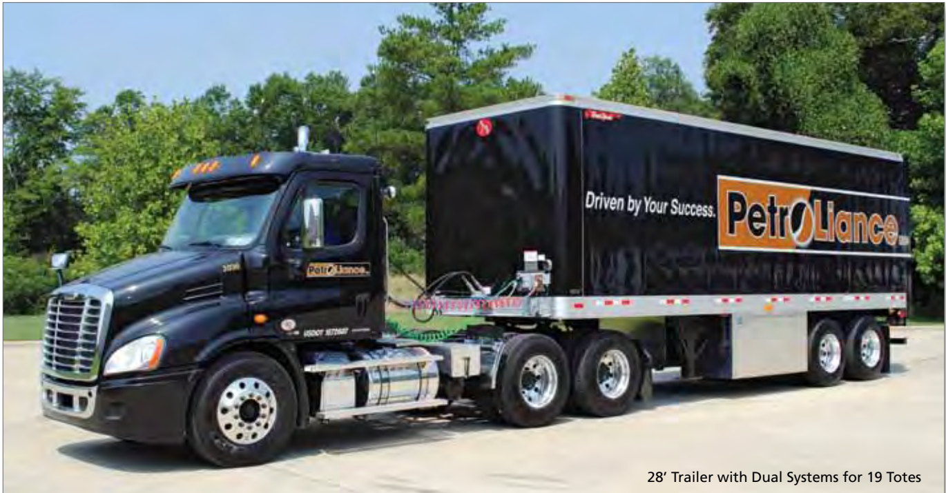
28' Trailer with Dual Systems for 19 Totes