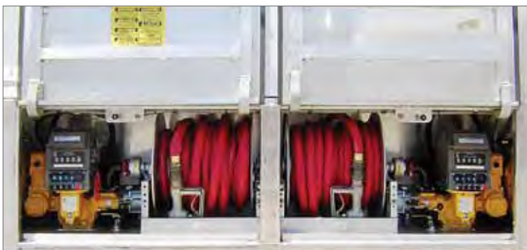
Dual Systems Mechanical Registers