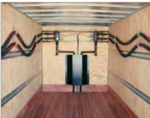
4 Tote System